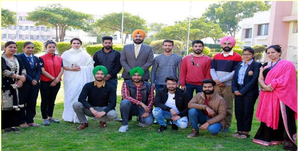
NSS camp organized by BGIET