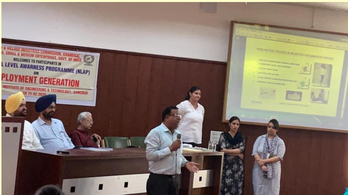
A seminar on employment generation held in BGIET