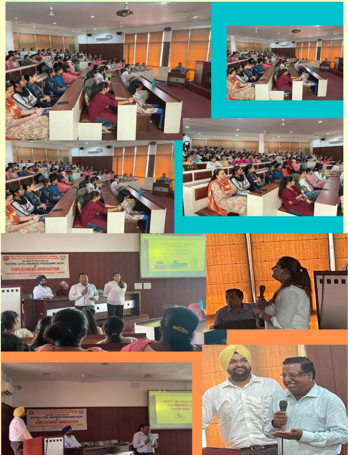
A seminar on employment generation held in BGIET