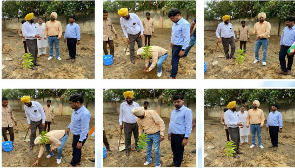
HONORABLE CHAIRMAN SIR ALONG WITH FACULTY PLANTING TREES