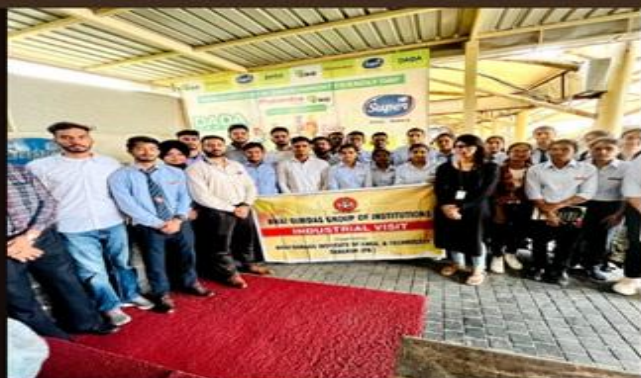
BGGI STUDENTS OF B.TECH FOOD TECHNOLOGY VISITED DAIRY INDUSTRY