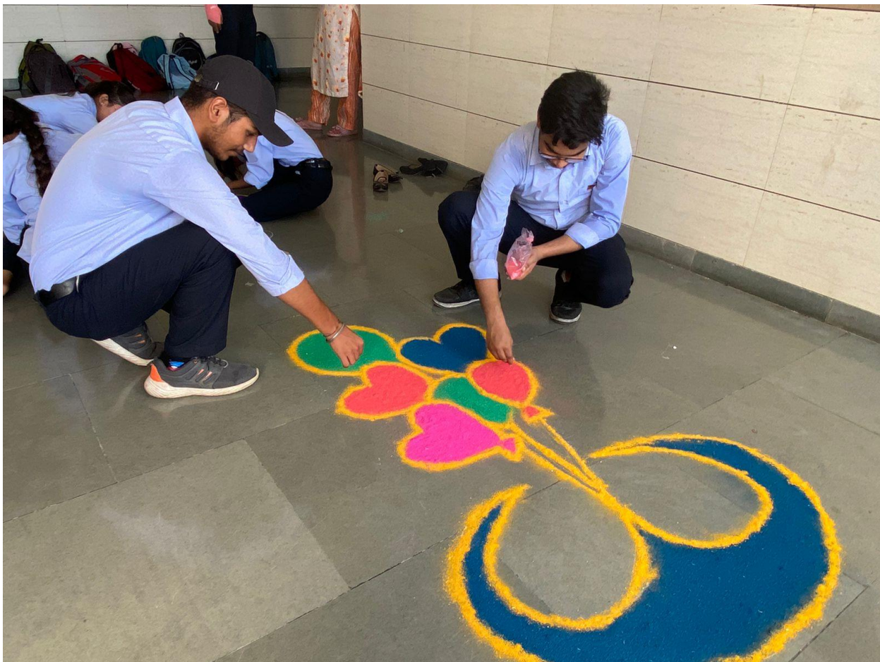
Entrepreneurship Awareness Camp